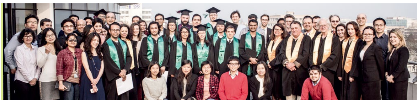
• PhD and MS in Business Administration Research Graduation Ceremony on March 20, 2015.