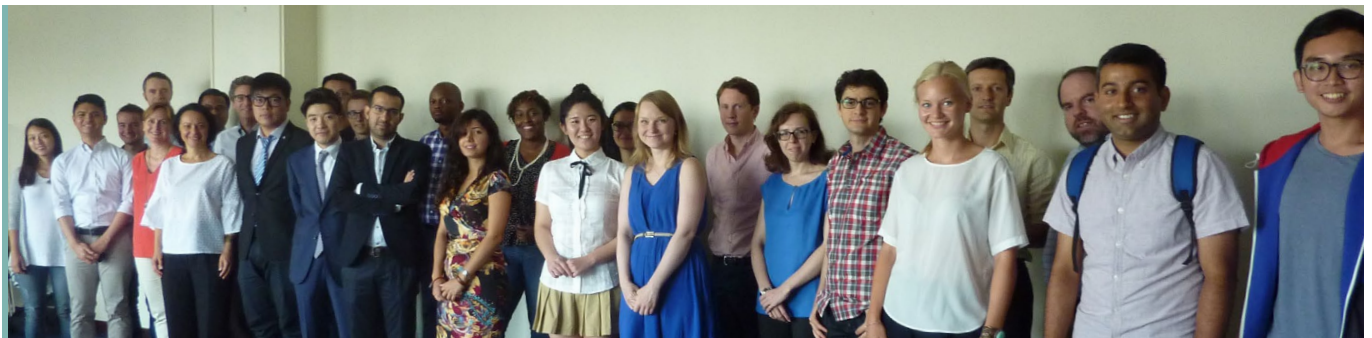
• August 2016 Welcome meeting for the new PhD cohort